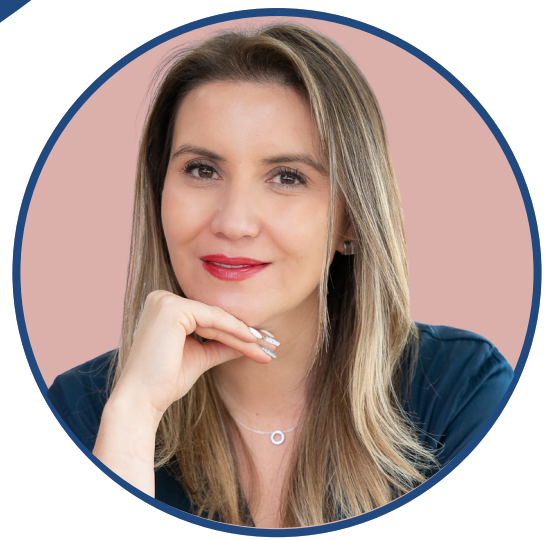
Yalile Said Vivanco Educational inclusion in private schools in Chile: current challenges and perspectives.